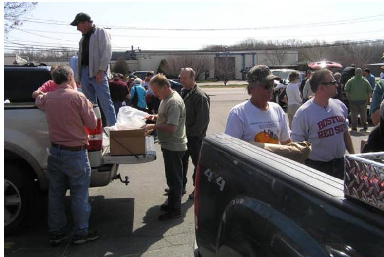
The free Seeds and Growers Pots were a hot commodity for those in attendance. These will help some growers get the best seeds possible in their patches this summer